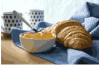
Networking at the Egg & I